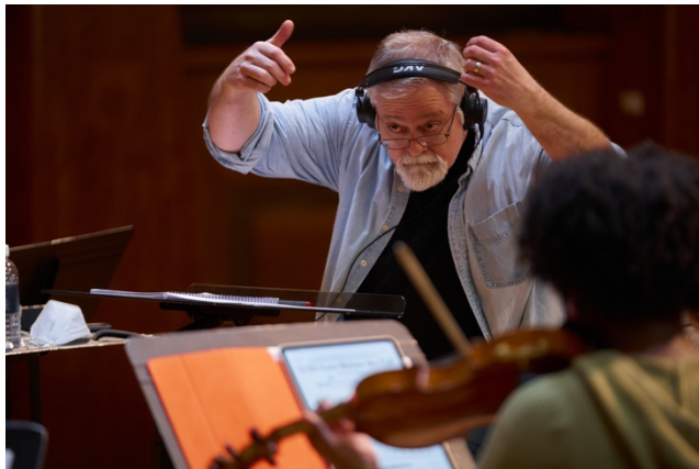
Conducting a scoring session for the soundtrack of the operafilm 9/10: Love Before the Fall at Ganz Hall, Chicago, 2022.