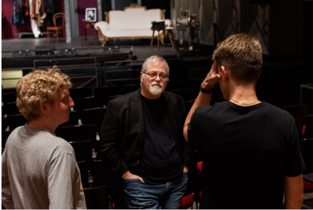
In theater with two of the Orsons from Louisiana State University's revival of Orson Rehearsed, Baton Rouge, LA, 2022.