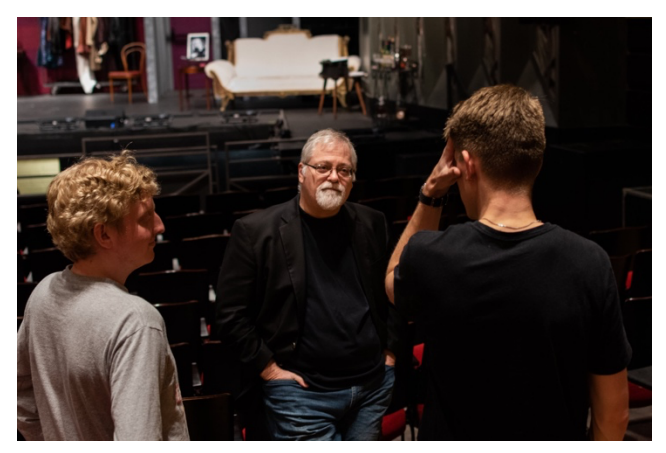
In theater with two of the Orsons from Louisiana State University's revival of Orson Rehearsed, Baton Rouge, LA, 2022.